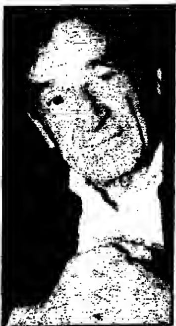
Elie Wiesel

Conflict over the makeup of the executive board of the Swiss compensation fund for Holocaust survivors was a main reason Nobel laureate Elie Wiesel refused to accept a position on the commission. He repeated Tuesday in an interview with The Jerusalem Post that he also did not feel comfortable about determining how to distribute the money.